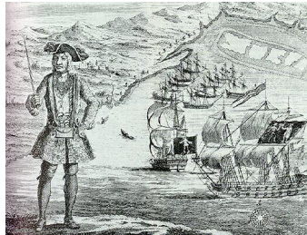
Wood Print of Roberts, circa 1724

Shortly after Roberts’ capture, Captain Davis was killed in an act of treachery at the Port of Princes, now